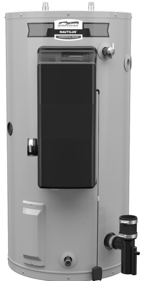
MODEL SHOWN PCG82-40S50L

*Continuous hot water based on 65,000 BTU unit, 2.8 GPM continuous flow with a 65°F inlet water temperature, 110°F outlet temperature, and a unit installed per the manufacturer's instructions.